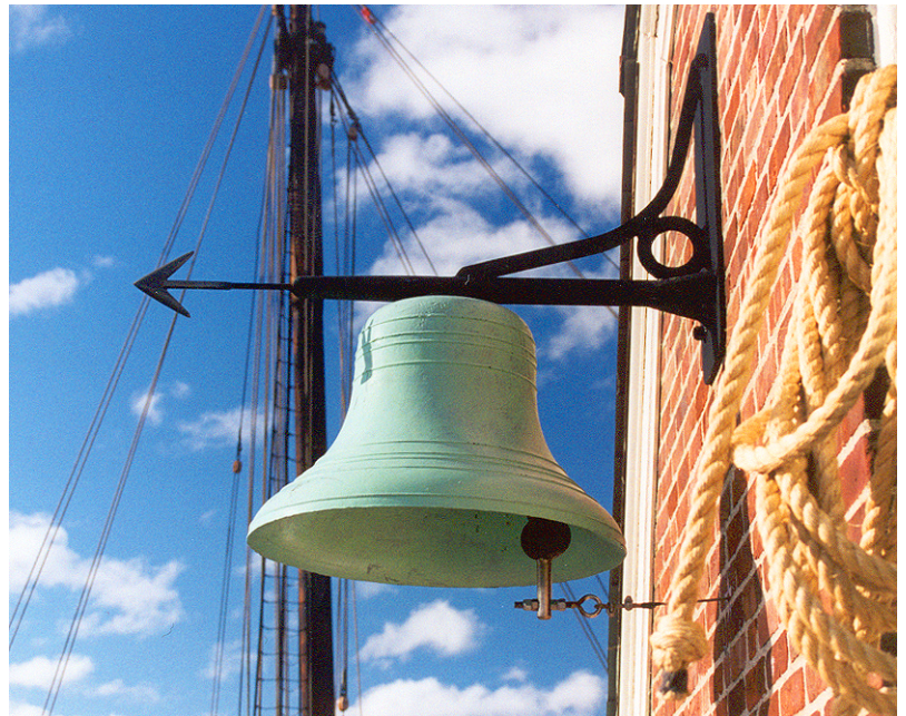
The William Street Bell (c.1849) was mounted on the harborside of the Wharfinger Building in 1999. It strikes "Ship's Bells" daily.